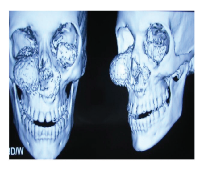
Figure 2. 3D reconstruction images of preoperative computed tomography.

Patient was explained about the natural course of disease. She was convinced to go ahead with surgery. As the lady was young, midfacial degloving approach was best suited for her. Patient was fit for surgery in all preoperative tests and checkups (Fig. 3).