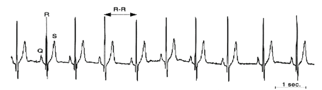
Figure 1. Extraction of sinusoidal RR intervals from ECG signals.

sion criteria are patients under cardiac treatment (Cordarone, antiarrhythmic, etc.) and the presence of heart diseases. All patients have given their consent to the study. Holter ECG is very accurate (300 Hz). The same Holter monitor brand was used of the brand (Vista Recorder, Novacor, Rueil-Malmaison). The Holter was placed at 8 pm of the night before the surgery and removed at 6 am of the next day: pre-washout Holter. Another recording was done at 6 pm after the surgery until 6 am in the next morning: Holter during washout. The frequency and the ANS activity were analyzed by means of the RR of Holter recordings. Spectral analysis of RR variability via the Fourier equation shows characteristic peaks allowing the calculation of indicators representing the autonomic nervous system activity. The most commonly used indicators are high frequencies (HFs) characterizing parasympathetic activity, low frequencies (LFs) exemplifying orthosympathetic and parasympathetic activities, and the LF/HF ratio describing the sympathovagal balance. Average comparisons were made using paired t -tests.