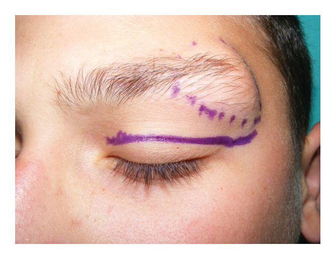
Figure 1. Marking of dermoid and eyelid crease.

tent 6-0 monocryl suture, skin was closed with 6-0 polypropylene suture intracutaneously and steri-strips were applied. Mean operative time was found as 20 min. Patients were followed up for 3 - 24 months (mean 10 months). Loss of vision or eyelid functions occurred in no patients. Cyst recurrence was observed in no patients. All patients or parents were satisfied with the scar. Scar was not perceptible especially when the eye is open.