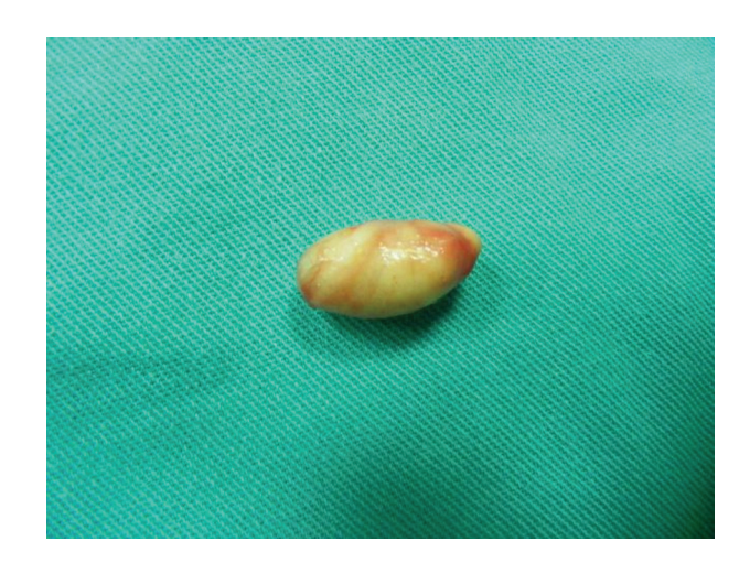
Figure 4. Complete excision of dermoid cysts.

Marking cyst borders and incision site preoperatively provide convenience for the surgeon. Eye should be closed with pomade in order to protect eyeball and a suspension suture should be placed. Upper eyelid incision is made 1 mm above supratarsal line. Incision should be 1 - 1.5 cm in size depending on the size and location of the cyst. Dissection may be done in two ways following incision. While cyst may be accessed over orbital septum by opening orbicularis muscle [8], muscle may be opened here when the mass is exposed through a dissection between the skin and the muscle (Fig. 2). We accessed the cyst between skin and muscle in all cases. So we avoided complications like injuring lavator aponeurosis, lacrimal gland or supe-