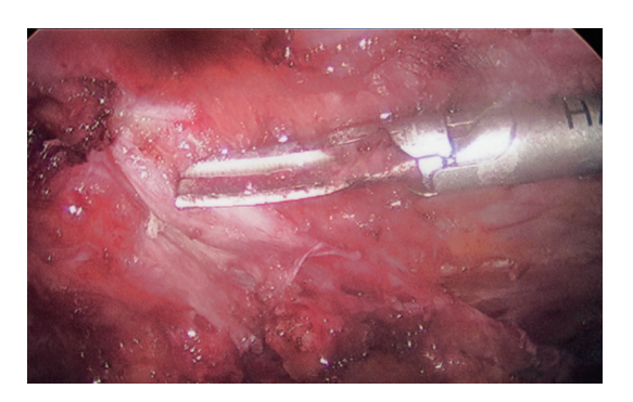
Figure 3. Dissection of urachal sinus.

Sinogramm was inconclusive. Voiding cystogramm was normal. CT showed urachal remnant connecting urinary bladder and umbilicus (Fig. 1). Patient received 5 days PO ABX preoperatively to decrease inflammation in the umbilical skin.