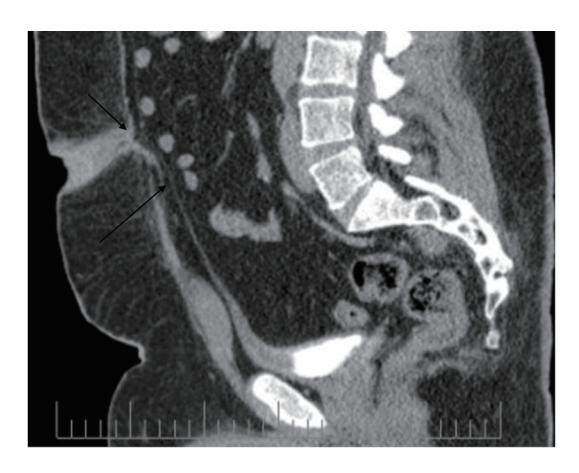
Figure 1. Inflamed umbilicus (short arrow) and urachal remnant (long arrow).

cion of urachal carcinoma [31]. There is no consensus about the resection of the umbilicus. Some advocates resection for resolution of symptoms and superior cosmetic results [15]. Others emphasize importance of meticulous dissection of the urachal remnant together with all inflamed tissues over umbilectomy [9].