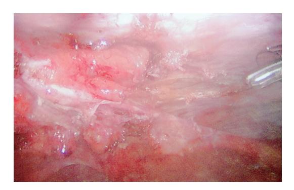
Figure 5. Dissection of side deviations.