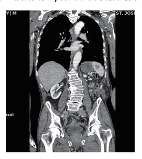
Figure 1. CT coronal view of left intercostal hernia protruding through ribs 10-11.

upon arrival, but he was complaining of intense pain over the lower anteromedial aspect of his chest that was associated with the appearance of a bulge in this same area after the fall. Primary and secondary surveys were completed in accordance with the advanced life trauma support (ATLS) protocol and no other life-threatening injuries were found. The patient then underwent computed tomography (CT) of the abdomen and pelvis that demonstrated a large 8 × 6 cm left-sided abdominal intercostal hernia with bowel protruding between ribs 10 and 11 (Fig. 1-3). The patient was taken to the operating room for laparoscopic repair of the hernia following informed consent. A Hasson<sup>TM</sup> cannula was placed at the umbilicus. The defect between ribs 10 and 11 was visualized and was noted to contain a significant amount of herniated colon and small bowel (Fig. 4, 5). After inspection and confirmation of an intact diaphragm, two additional 5-mm trocars were then placed in the mid-epigastrium and suprapubic regions, respectively. The bowel was reduced into the abdomen and was inspected. A 0.5 cm serosal tear was noted on the jejunum that was closed with 3-0 silk suture. The hernia defect was then repaired with a flexible composite polypropylene and polyglecaprone-25 mesh (Ethicon Physiomesh<sup>TM</sup>) in underlay fashion such that there was 3 - 4 cm overlap circumscribing the edges of the defect. The mesh was secured in place with transfascial sutures at the