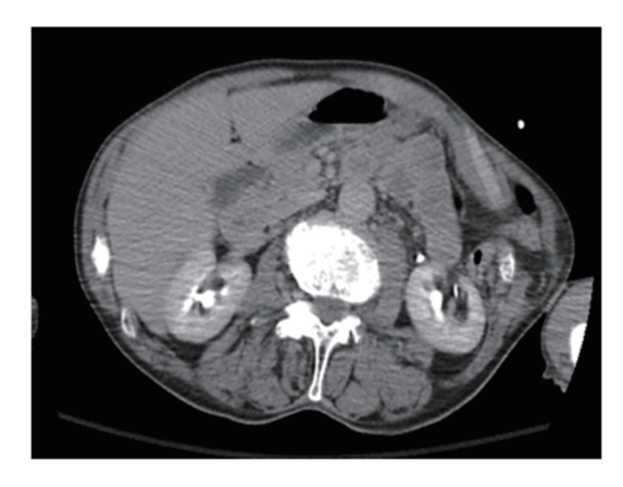
Figure 3. CT cross-section demonstrating left intercostal hernia.

Abdominal hernia repair represents a mainstay of general surgery practice. Abdominal hernias that protrude through the intercostal muscles, however, are a rare phenomenon. Less than 40 cases of transdiaphragmatic intercostal hernias have been reported in the literature [1, 2]. Even fewer still are cases of intercostal hernias under an intact diaphragm [3]. Intercostal hernias are associated with an increase in abdominal pressure and may develop acutely or over a number of years. A significant or persistent increase in abdominal pressure can tear the intercostal muscles and even fracture underlying ribs. Positive intrathoracic pressure forces the contents out through weak-