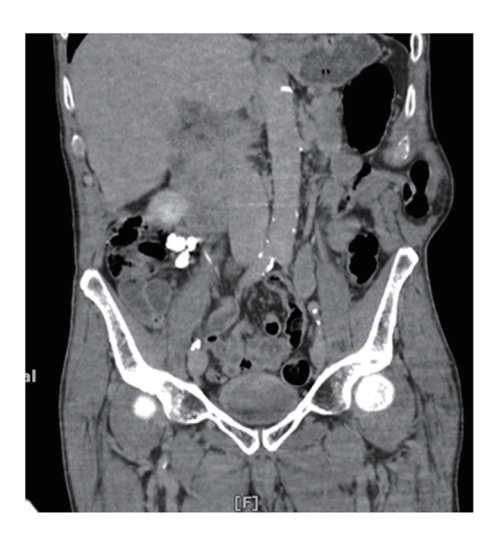
Figure 2. CT coronal view of left intercostal hernia protruding through ribs 10-11.

superior and inferior poles of the mesh and Absorba<sup>TM</sup> tacks radially (Fig. 6, 7). The patient was discharged home 1 day following surgery with minimal discomfort. The patient was seen subsequently in clinic for his 1-month follow-up without complaint. On physical exam, there appeared to be no sign suggestive of hernia recurrence.