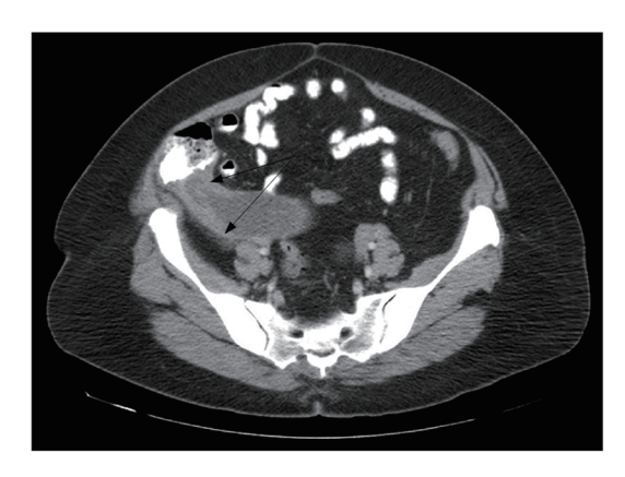
Figure 1. CT abdomen and pelvis with PO and IV contrast, axial view. Tubular structure in right iliac fossa with broad base and thick wall (arrows).

Appendiceal mucoceles, first described by Rokitansky, repre-