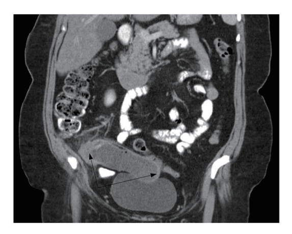
Figure 2. CT abdomen and pelvis with PO and IV contrast, coronal view. Tubular structure in right iliac fossa with broad base and thick wall (arrows).

sent a progressive dilatation of the appendix from intraluminal accumulation of the mucus [1]. They are rare entities with an incidence 0.2-0.7% in appendectomy (APPY) cases [2-6]. Among all appendiceal tumors, mucocele is second only to carcinoid [7].