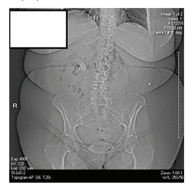
Figure 2. Abdominal X-ray in the ED.

CT scans of the chest and abdomen (Fig. 3) were conducted. Her workup for pulmonary embolus was negative; the heart was normal in size and the descending aorta and main pulmonary artery were not enlarged; however, there was presence of centrilobular emphysema and mucus plugging in both lower lobes. CT showed incidental finding of a large heterogenous perisplenic collection consistent with a hematoma and