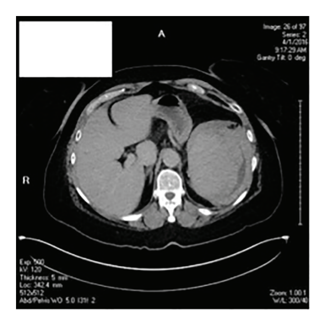
Figure 3. CT scans of chest, abdomen and pelvis.

hemoperitoneum layering in the pelvis. Acute care surgery was consulted.