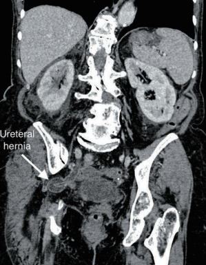
Figure 1. Multiphasic CT images show a right supra-piriform hernia with perineal infiltration and pyelo-ureteritis.

sultation a month later. The patient was reviewed at 3 months of surgery (postoperative) with a urology CT scan describing a segmental ureteral thickening at the anastomosis without stenosis with a comparative drainage of urine on each side.