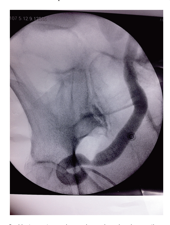
Figure 2. Ureter retrograde pyelography showing pathognomonic omega sign.

The ischiatic foramen represents a transition path between the pelvic region and the gluteal region. Divided into two (large and small ischiatic foramen) by the sacrospinous ligament, several noble elements pass through it [1]. The piriformis muscle is inserted at the anterior part of the sacrum and ends on the great-