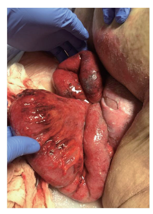
Figure 1. Physical exam findings on presentation. The photo shows eviscerated loops of small bowel with areas of duskiness and congestion concerning for ischemia.

and noted to be congested and edematous but without signs of ischemia or necrosis. The pelvic organs were then addressed by the gynecology oncology team and a total abdominal hysterectomy with bilateral salpingo-oophorectomy was performed with primary closure of the vaginal cuff using interrupted figure-of-eight Vicryl sutures. A defect in the posterior vaginal cul-de-sac at the pouch of Douglas was identified as the site of evisceration (Fig. 2) and this was closed primarily with running #1 polydioxanone (PDS). The edges of the vaginal disruption were suspended to the vaginal cuff. The ureters and rectum were inspected and noted to be intact and free from injury. At this point, pelvic reconstruction with mesh was felt to be high-risk given the concern for contamination and infection. It was determined that the patient would best benefit from a delayed repair of the pelvic floor, potentially through a transvaginal approach. The abdomen was then closed with excision of the ventral hernia sacs and primary repair of the defects.