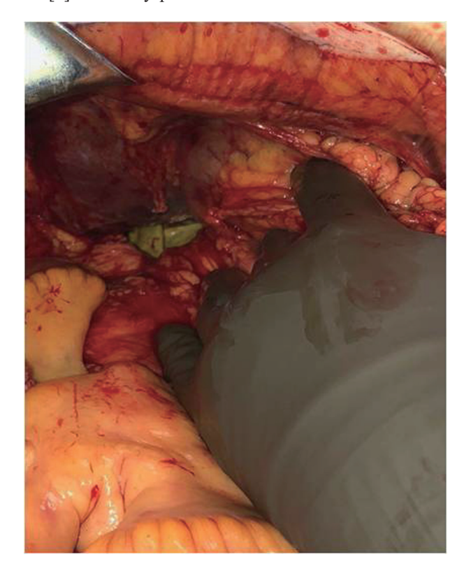
Figure 3. Penrose drain attached to left rectus abdominus flap for coverage of right renal fossa.

There are two different types of NF and the organisms that cause it to distinguish them from each other. Type 1, the more complex of the two, is caused by a mixture of both aerobe and anaerobe species and is more commonly seen in patients who are immunocompromised or have chronic diseases such as diabetes [7]. It usually presents in conditions that are favorable