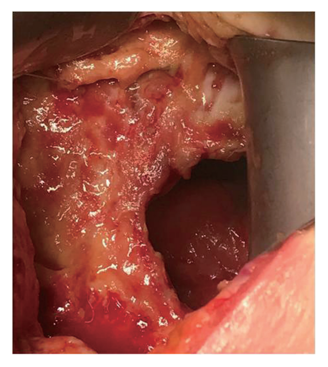
Figure 4. Posterior view from back with intraluminal view of ascending colon.

for polymicrobial growth including diabetics, fistulas, rectal fissures, hemorrhoids, surgeries and episiotomies [8]. Type 1 is classically associated with crepitus and suggests gas-forming organisms but is not always present [1]. Type 2, unlike type 1, can occur in any age group and even in those without prior illness. It is monomicrobial in nature, with group A streptococcus being the most common, followed by methicillin-resistant Staphylococcus aureus (MRSA) [7]. Less common pathogens such as Vibrio vulnificus, Clostridium spp , and Aeromonus hydrophila may also represent a third type [9].