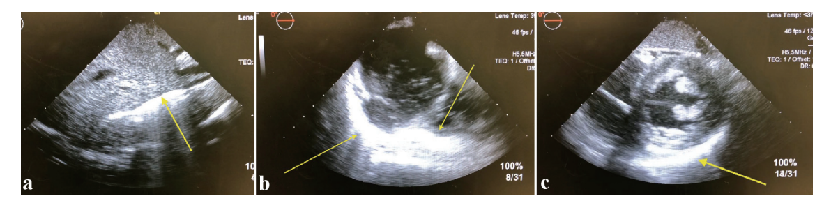
Figure 2. Transesophageal echocardiography showing findings suggestive of portal vein embolism.

Although a very rare occurrence, venous air embolism from laparoscopic insufflation can have devastating outcomes. Multiple case reports have shown similar events due to hepatic anatomical differences. The main underlying principle is rapid identification of potential life-threatening differentials. Possible differentials of anaphylaxis, extubation, kinked endotracheal tube, an obstructive process, or spontaneous pulmonary embolism (PE), should be considered. A theoretical dose of 100 mL of air has the capability to fill the chambers of the right heart, which can quickly lead to fatal cardiac arrest. A higher suspicion and vigilance should be set in a protocolized fashion to avoid negative outcomes. We would argue for all hepatic cases to have a protocolized approach in regard to communication between anesthesia and surgery, in regard to surgical plan, perioperative access and management. Venous and arterial access prior to surgery for the potential mitigation of treatment of unexpected complications should be protocolized, as patients with aberrant intraabdominal pathology can have significant negative outcomes. An algorithmic approach to hepatic surgery can help reduce the effects of negative outcomes.