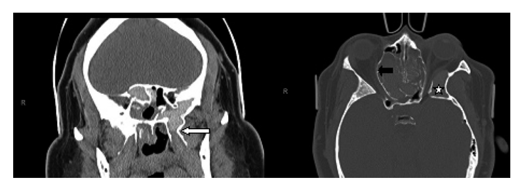
Figure 2. Coronal CT scan of the paranasal sinuses (left image) demonstrates the hyperaerated left sphenoid sinus extending far lateral and inferior with opacification of the left pterygoid (white arrow). The axial CT scan (right image) demonstrates bulging of the lamina papyracea into the orbits, more so on the right side (black arrow). There is redemonstration of the aerated and opacified left greater wing of sphenoid (white star).

It is important to examine the appearance of the sphenoid sinus on CT scan. The normal physiological pneumatization of the sphenoid sinus leads to formation of recesses that are variably prominent; these include the opticocarotid recess, an aerated greater wing of the sphenoid, and the pterygoid