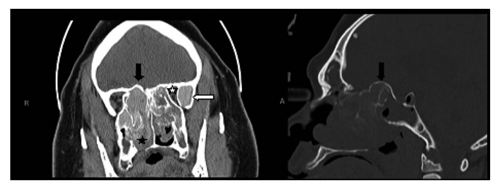
Figure 1. Coronal CT scan of the paranasal sinuses (left image) shows enlarged and opacified left greater wing of sphenoid with high attenuation material (white arrow), along with narrowing of the orbital apex on the left compared to the right side (white star). The fungal hyperattenuation areas also extend intranasally (black star). There is bulging of the roof of the posterior ethmoids into the intracranial space as demonstrated on both the coronal and sagittal CT scans (right image) labeled with black arrows.

cin B nasal irrigation. He regained his color vision, but had no improvement in visual fields. His recalcitrant disease is partly explained by the nature of his allergic fungal sinusitis, a disease whose etiology is controversial [6], but typically results in accumulation of fungal debris and production of allergic mucin with resultant severe chronic mucosal inflammation.